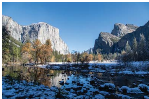
04-El Capitan First Snow.jpg