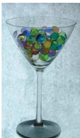
03-Bottoms Up .jpg